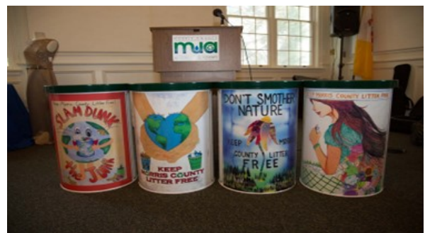
Recycling bins with replicated art.